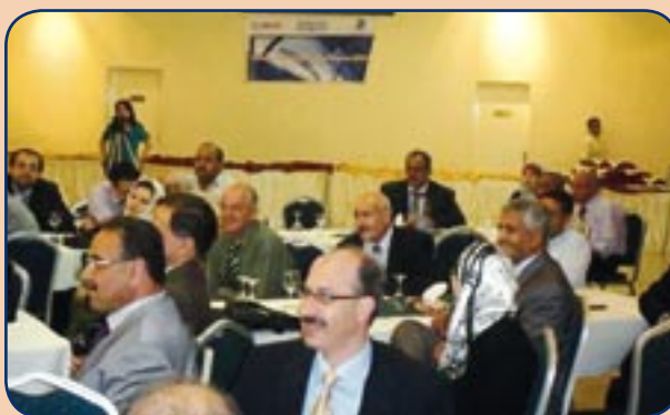
Participants during the first workshop titled “Gaza Graduates ... where to?”

As part of its yearlong support to university faculty to expand on their teaching horizons, PFDP conducted two faculty development series in Gaza. The first took place on May 12 and was titled “Gaza Graduates...where to?” The seminar discussed future work opportunities for Gaza graduates under the current uncertain political and economic situation. The seminar also described the best mechanisms to establish connection between what is offered in academic programs and what is needed by the labor market. The last part of the seminar discussed using employment intermediaries and how these intermediaries can play a major role in providing post graduation training that will qualify graduates for specific work opportunities. Eighty participants from different universities attended the workshop.