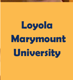
Loyola Marymount University